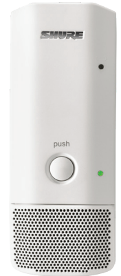
MXW6W Boundary Transmitter