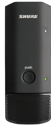
MXW6 Boundary Transmitter