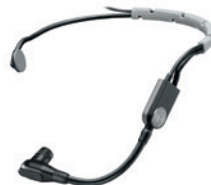
SM35 Headset Microphone