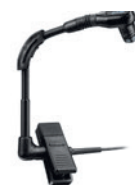
WB98H/C Clip-On Instrument Microphone