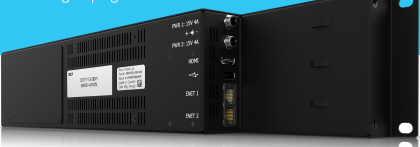
Ultricore - rear