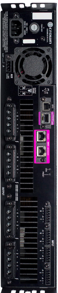
8|300DA model shown